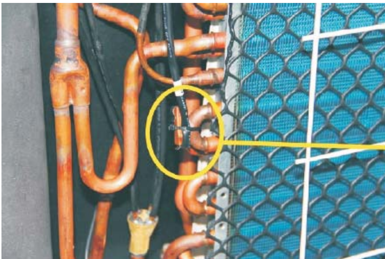
T3: Pipes temperature sensor 5K1.2m copper