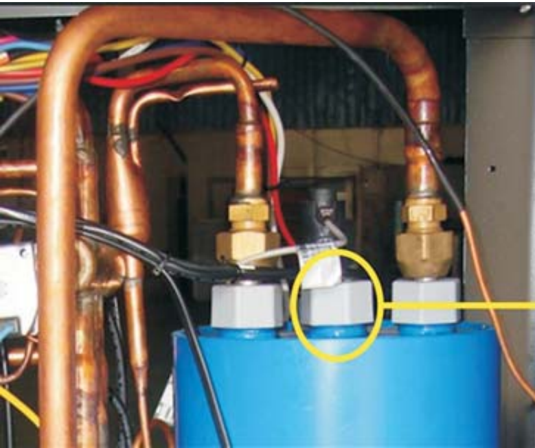
T2: Water outlet temperature sensor 5K1.2m copper