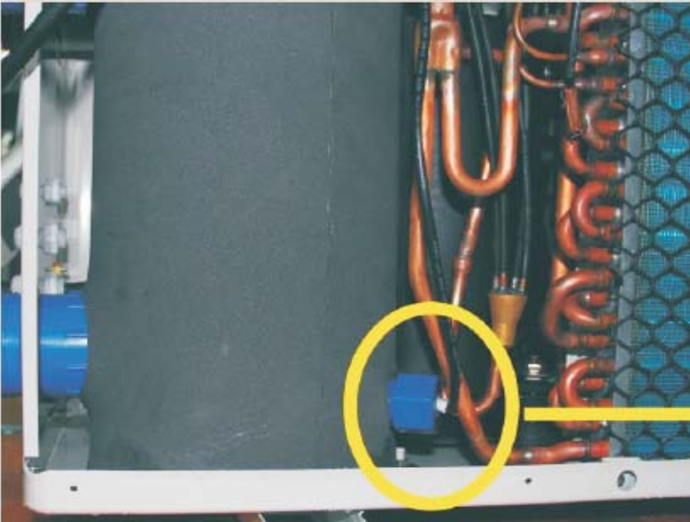
T1: Water inlet temperature sensor 5K1.2m copper