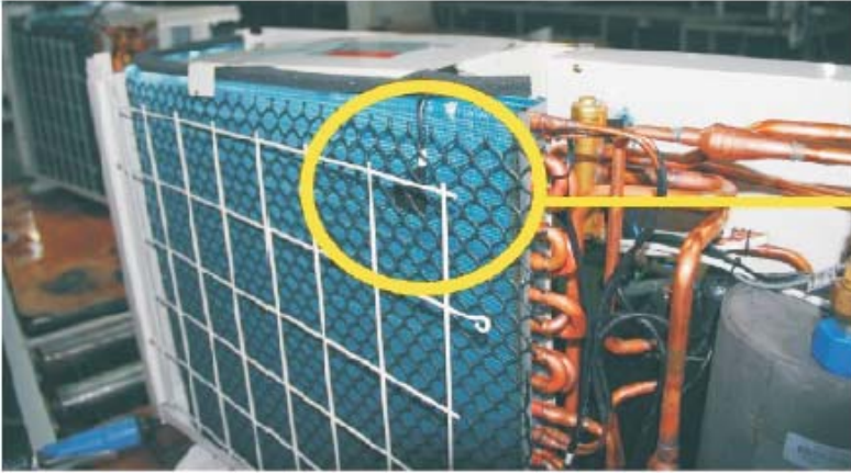
T5: Ambient temperature sensor 5K1.2m plastic